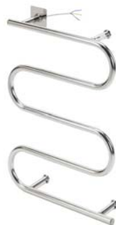
Model HT- 60S Dimensions: 643 x 470 x 125 mm Supply voltage: 60W / 230V / 50HZ Material: Stainless steel Finish: Polished