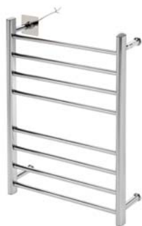
Model HT- 90H Dimensions: 750 x 510 x 140mm Supply voltage: 90W / 230V / 50Hz Material: Steel Finish: Chrom